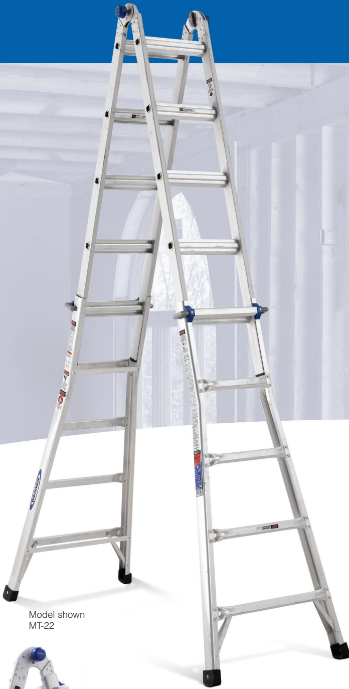
Model shown MT-22