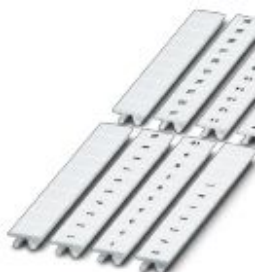
Zack marker strip, 10-section, horizontally labeled with the consecutive numbers: 71 ... 80, white, width: 8 mm

Please be informed that the data shown in this PDF Document is generated from our Online Catalog. Please find the complete data in the user's documentation. Our General Terms of Use for Downloads are valid ( http://phoenixcontact.com/download )