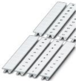
Zack marker strip, 10-section, horizontally labeled with the consecutive numbers: 61 ... 70, white, width: 8 mm

Please be informed that the data shown in this PDF Document is generated from our Online Catalog. Please find the complete data in the user's documentation. Our General Terms of Use for Downloads are valid ( http://phoenixcontact.com/download )