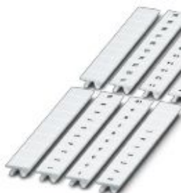
Zack marker strip, 10-section, horizontally labeled with the consecutive numbers: 51 ... 60, white, width: 8 mm

Please be informed that the data shown in this PDF Document is generated from our Online Catalog. Please find the complete data in the user's documentation. Our General Terms of Use for Downloads are valid ( http://phoenixcontact.com/download )