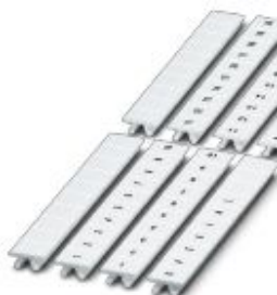
Zack marker strip, 10-section, horizontally labeled with the consecutive numbers: 41 ... 50, white, width: 8 mm

Please be informed that the data shown in this PDF Document is generated from our Online Catalog. Please find the complete data in the user's documentation. Our General Terms of Use for Downloads are valid ( http://phoenixcontact.com/download )