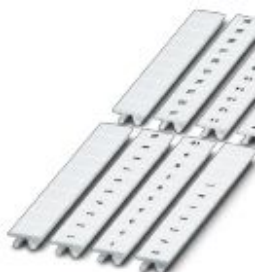
Zack marker strip, 10-section, horizontally labeled with the consecutive numbers: 31 ... 40, white, width: 8 mm

Please be informed that the data shown in this PDF Document is generated from our Online Catalog. Please find the complete data in the user's documentation. Our General Terms of Use for Downloads are valid ( http://phoenixcontact.com/download )