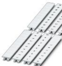
Zack marker strip, 10-section, horizontally labeled with the consecutive numbers: 21 ... 30, white, width: 8 mm

Please be informed that the data shown in this PDF Document is generated from our Online Catalog. Please find the complete data in the user's documentation. Our General Terms of Use for Downloads are valid ( http://phoenixcontact.com/download )