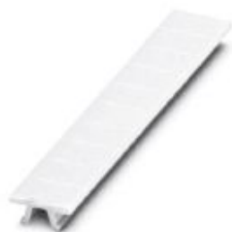
Zack marker strip, 10-section, horizontally labeled with the consecutive numbers: 81 ... 90, white, width: 6 mm

Please be informed that the data shown in this PDF Document is generated from our Online Catalog. Please find the complete data in the user's documentation. Our General Terms of Use for Downloads are valid ( http://phoenixcontact.com/download )