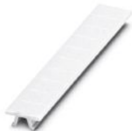
Zack marker strip, 10-section, horizontally labeled with the consecutive numbers: 71 ... 80, white, width: 6 mm

Please be informed that the data shown in this PDF Document is generated from our Online Catalog. Please find the complete data in the user's documentation. Our General Terms of Use for Downloads are valid ( http://phoenixcontact.com/download )