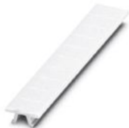
Zack marker strip, 10-section, horizontally labeled with the consecutive numbers: 61 ... 70, white, width: 6 mm

Please be informed that the data shown in this PDF Document is generated from our Online Catalog. Please find the complete data in the user's documentation. Our General Terms of Use for Downloads are valid ( http://phoenixcontact.com/download )