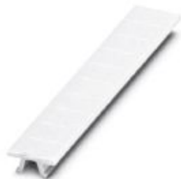
Zack marker strip, 10-section, horizontally labeled with the consecutive numbers: 51 ... 60, white, width: 6 mm

Please be informed that the data shown in this PDF Document is generated from our Online Catalog. Please find the complete data in the user's documentation. Our General Terms of Use for Downloads are valid ( http://phoenixcontact.com/download )