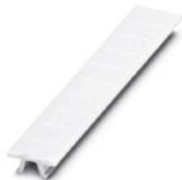
Zack marker strip, 10-section, horizontally labeled with the consecutive numbers: 41 ... 50, white, width: 6 mm

Please be informed that the data shown in this PDF Document is generated from our Online Catalog. Please find the complete data in the user's documentation. Our General Terms of Use for Downloads are valid ( http://phoenixcontact.com/download )