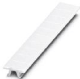
Zack marker strip, 10-section, horizontally labeled with the consecutive numbers: 21 ... 30, white, width: 6 mm

Please be informed that the data shown in this PDF Document is generated from our Online Catalog. Please find the complete data in the user's documentation. Our General Terms of Use for Downloads are valid ( http://phoenixcontact.com/download )