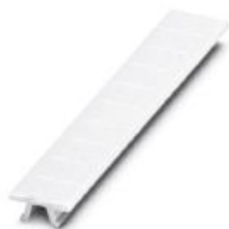
Zack marker strip, 10-section, horizontally labeled with the consecutive numbers: 11 ... 20, white, width: 6 mm

Please be informed that the data shown in this PDF Document is generated from our Online Catalog. Please find the complete data in the user's documentation. Our General Terms of Use for Downloads are valid ( http://phoenixcontact.com/download )