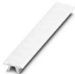
Zack marker strip, 10-section, horizontally labeled with the consecutive numbers: 1 ... 10, white, width: 6 mm

Please be informed that the data shown in this PDF Document is generated from our Online Catalog. Please find the complete data in the user's documentation. Our General Terms of Use for Downloads are valid ( http://phoenixcontact.com/download )