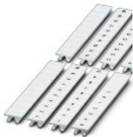
Zack marker strip, 10-section, horizontally labeled with the consecutive numbers: 91 ... 100, white, width: 5 mm

Please be informed that the data shown in this PDF Document is generated from our Online Catalog. Please find the complete data in the user's documentation. Our General Terms of Use for Downloads are valid ( http://phoenixcontact.com/download )