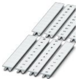
Zack marker strip, 10-section, horizontally labeled with the consecutive numbers: 71 ... 80, white, width: 5 mm

Please be informed that the data shown in this PDF Document is generated from our Online Catalog. Please find the complete data in the user's documentation. Our General Terms of Use for Downloads are valid ( http://phoenixcontact.com/download )