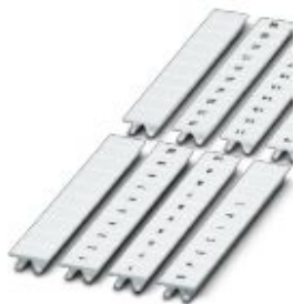
Zack marker strip, 10-section, horizontally labeled with the consecutive numbers: 51 ... 60, white, width: 5 mm

Please be informed that the data shown in this PDF Document is generated from our Online Catalog. Please find the complete data in the user's documentation. Our General Terms of Use for Downloads are valid ( http://phoenixcontact.com/download )