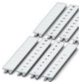
Zack marker strip, 10-section, horizontally labeled with the consecutive numbers: 41 ... 50, white, width: 5 mm

Please be informed that the data shown in this PDF Document is generated from our Online Catalog. Please find the complete data in the user's documentation. Our General Terms of Use for Downloads are valid ( http://phoenixcontact.com/download )