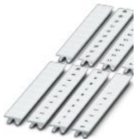
Zack marker strip, 10-section, horizontally labeled with the consecutive numbers: 31 ... 40, white, width: 5 mm

Please be informed that the data shown in this PDF Document is generated from our Online Catalog. Please find the complete data in the user's documentation. Our General Terms of Use for Downloads are valid ( http://phoenixcontact.com/download )