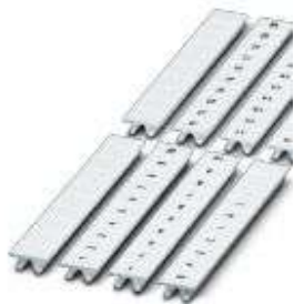
Zack marker strip, 10-section, horizontally labeled with the consecutive numbers: 1 ... 10, white

Please be informed that the data shown in this PDF Document is generated from our Online Catalog. Please find the complete data in the user's documentation. Our General Terms of Use for Downloads are valid ( http://phoenixcontact.com/download )