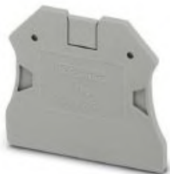
End cover, length: 47 mm, width: 2.2 mm, height: 39.8 mm, color: gray

Please be informed that the data shown in this PDF Document is generated from our Online Catalog. Please find the complete data in the user's documentation. Our General Terms of Use for Downloads are valid ( http://phoenixcontact.com/download )