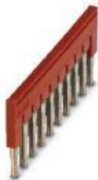
Plug-in bridge, pitch: 6.2 mm, width: 60.3 mm, number of positions: 10, color: red

Please be informed that the data shown in this PDF Document is generated from our Online Catalog. Please find the complete data in the user's documentation. Our General Terms of Use for Downloads are valid ( http://phoenixcontact.com/download )